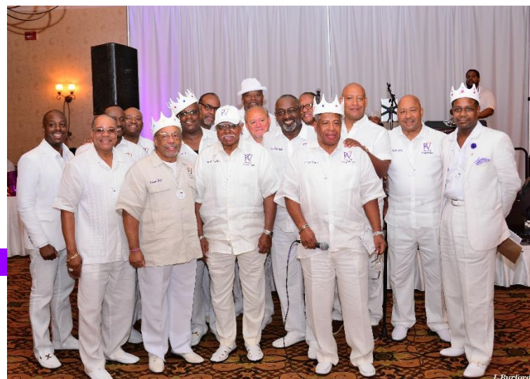
2018 Royal White Party Committee